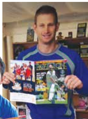
Adam Voges; Yet another fan of Pavilion

West Indian leggie Dev Bishoo enjoys 'Pavilion' at the SCG Bookstall.