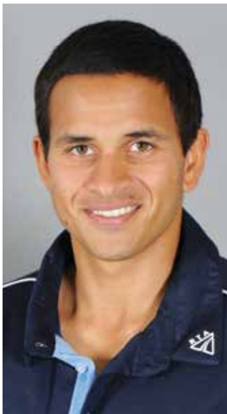
The President's 2015-16 favourite: Usman Khawaja

Make no mistake. Test cricket is under siege and no amount of rhetoric from officialdom will convince me otherwise. Teams must insist on three meaningful lead-up games of red-ball cricket before taking on Australia on home wickets. Otherwise we will have to be prepared for more walkovers - and no one wants that.