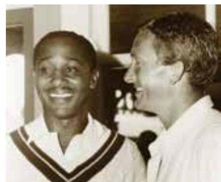
West Indian captain and legend Sir Frank Worrell with his Australian counterpart in 1960-61, Richie Benaud